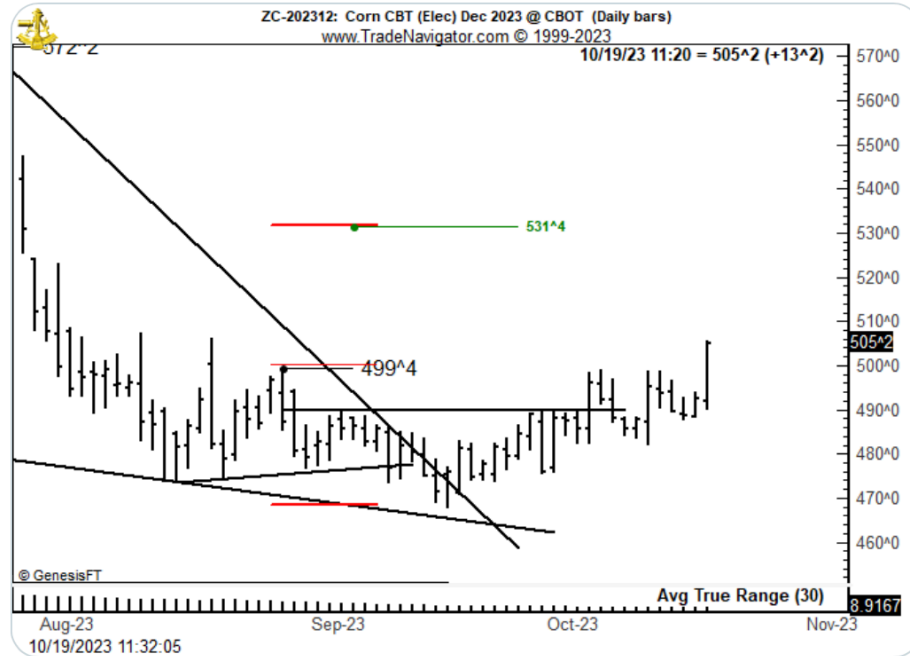
Chart of positional interest. I have moved back to a 100% long position in Dec Corn $ZCZ23