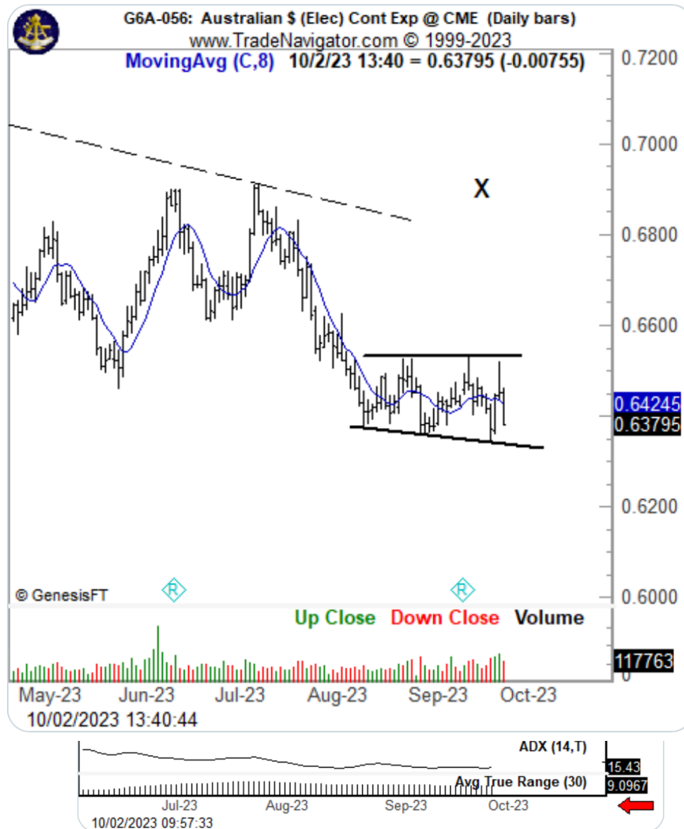
Chart of short-term interest - Australian $ $G6A_F Right angled broadening patterns typically, but not always, breakout of horizontal boundary