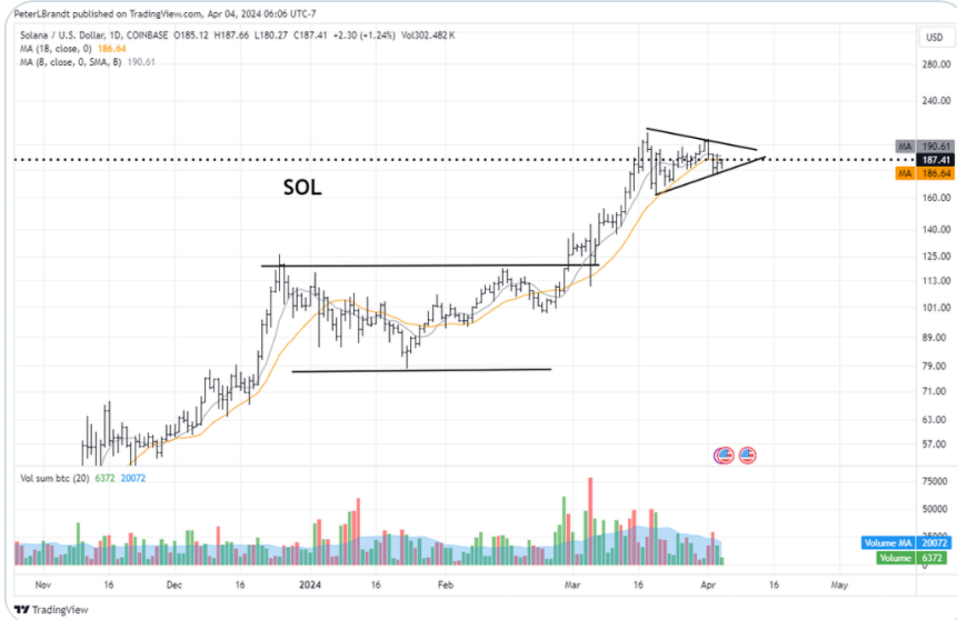
Chart of tradeable interest $SOL I am watching this chart like a hawk